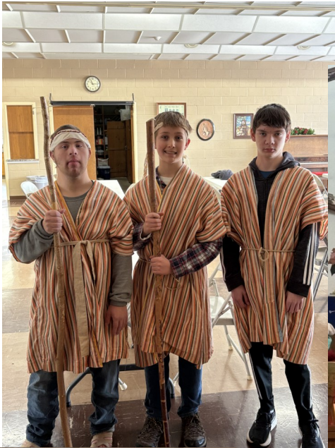
Hanging of the