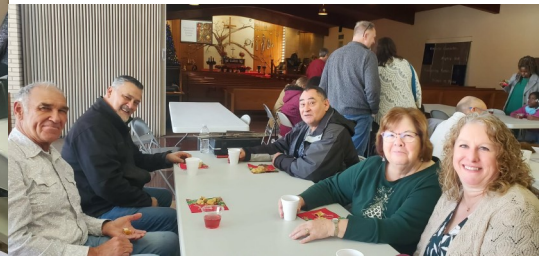
THE LAST KID'S KARD OF 2025